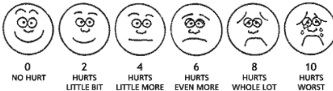
Wong-Baker FACES Pain Rating Scale